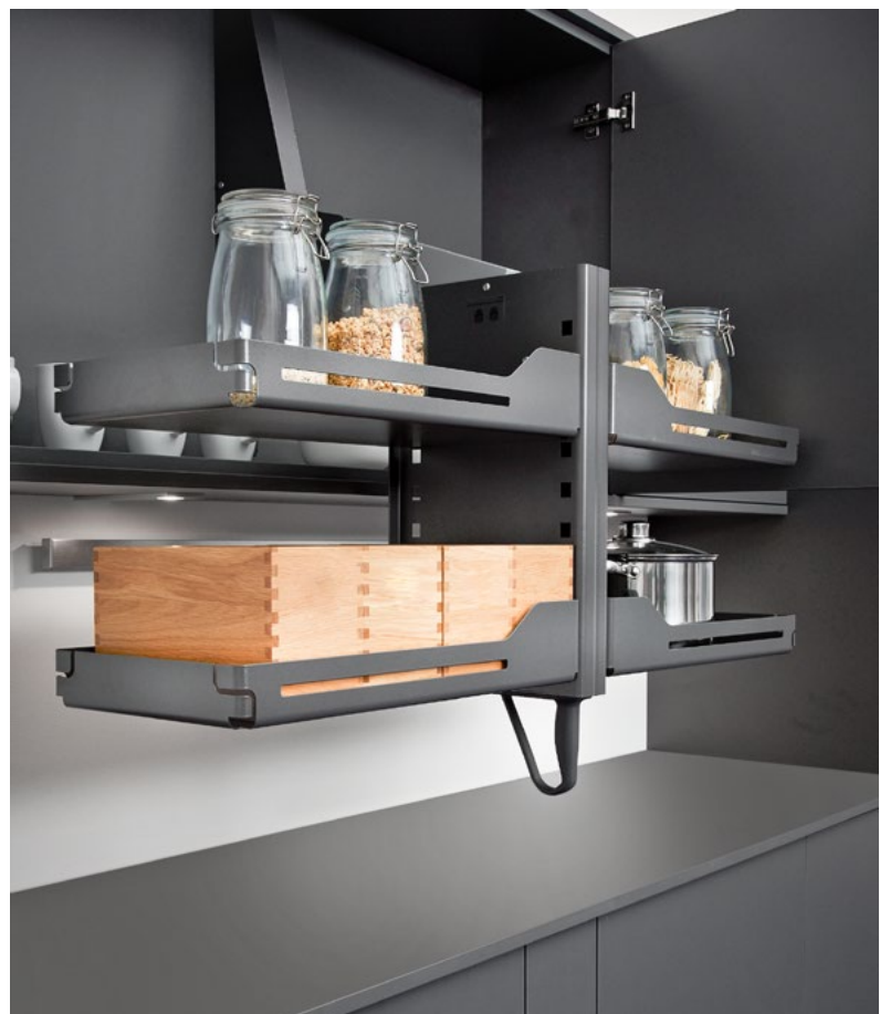
Pegasus shelf lift: The premium shelf lift for easy access to high shelves