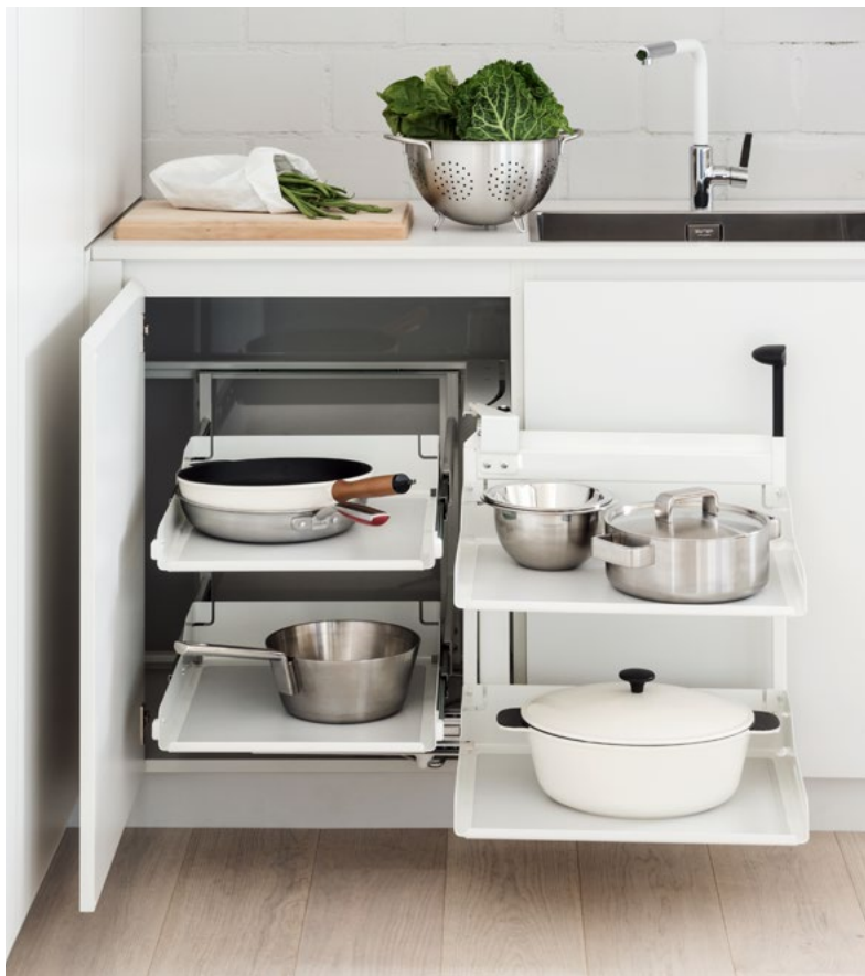
Magic Corner Comfort corner pull-out: Just open the door and pull on the handle to make the front shelves swing right out of the unit