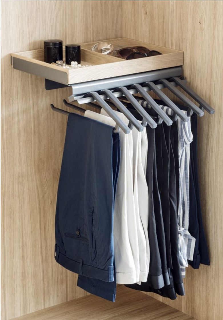
Lina trouser rack with wooden box: The innovative hangers for storing trousers without creasing them