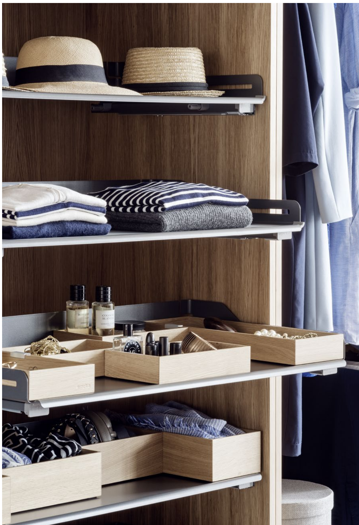
Extendo pull-out shelf and wooden boxes: The flexible pull-out shelf that is right at home anywhere