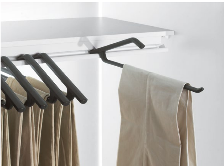
Lina trouser rack: The hanger can be back-mounted to the shelf, allowing you to hang trousers easily while keeping both hands free