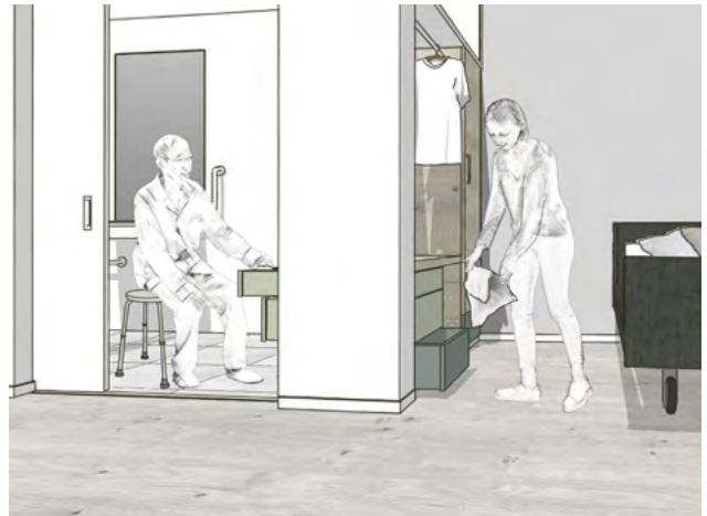
Application: Retirement, nursing homes