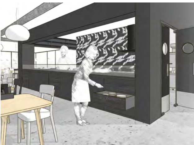
Application: Canteens, restaurants