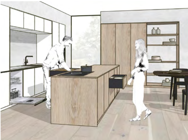
Application: Kitchen islands

Riverso is incredibly user-friendly too: the system is based on a full-extension draw runner with a load capacity of 46 kg and excellent running action, features soft-closing devices and can be fitted with a push-to-open system on one side for handleless fronts.