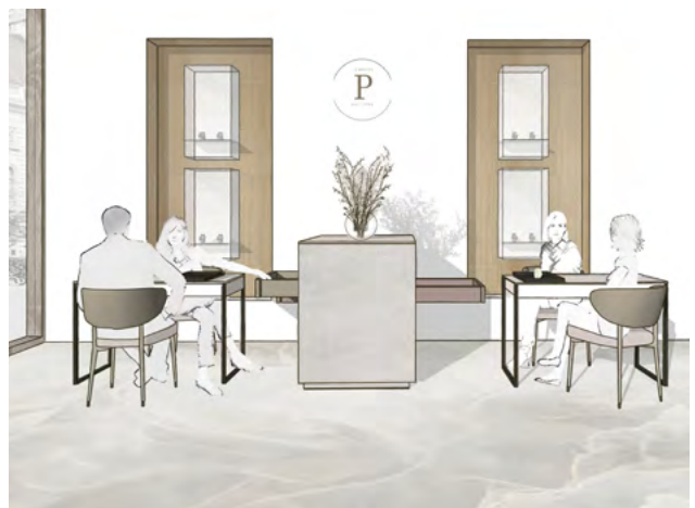
Application: Shop counters, points of sale